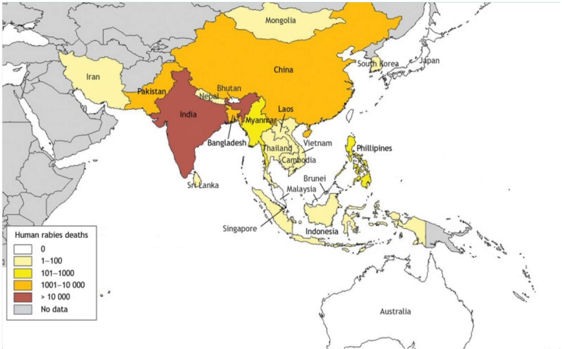
Incidence of human deaths from rabies in Asia, 2004 (WHO)